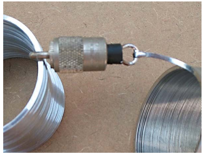
This photo shows the detail of connecting the Slinky to the loop of wire. Cut the end off the Slinky at the clip and bend a look in it with a pair of thin nosed pliers. Hook it into the loop of wire and crimp it down with the pliers. Apply lots of solder and you're all set.

This is the dis-assembled antenna with a couple of baluns to give you an idea of what is in the plastic box. The balun on the left is the "gold standard" which has been around forever. It has a ferrite rod inside the coil but in spite of the quality of this unit, it uses those lousy plated eyebolts! Inside the tube, the wires connect to a solder lug which is under the eyebolt's nut. If you should happen to accidentally loosen the eyebolt, the connection will go bad and there is no way to retighten it. Use with caution. The balun to the right of the W2AU unit is like the one I used. No ferrite and its just a tri-filer winding on a short piece of schedule 40 pipe. About 25 cents worth of material but difficult to make. It fits inside the box nicely. If you don't want to use a balun it should work fairly well without one. Just use a standard dipole center connector and solder everything together just like a conventional dipole.